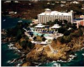
FRENCHMAN'S REEF & MORNING STAR MARRIOTT BEACH RESORT, UNITED STATES VIRGIN ISLANDS