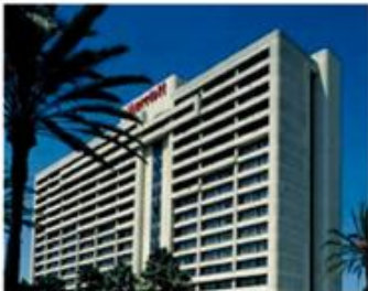
TORRANCE MARRIOTT, CALIFORNIA