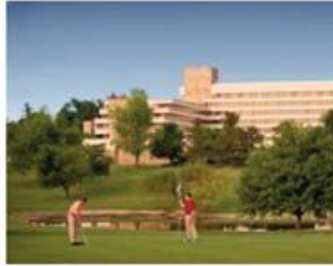
MARRIOTT GRIFFIN GATE RESORT, KENTUCKY