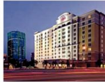
SPRINGHILL SUITES ATLANTA BUCKHEAD, GEORGIA