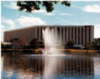
ORLANDO AIRPORT MARRIOTT, FLORIDA