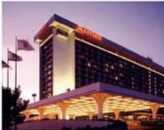
LOS ANGELES AIRPORT MARRIOTT, CALIFORNIA