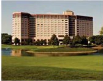
OAK BROOK HILLS MARRIOTT RESORT, ILLINOIS