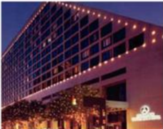
RENAISSANCE WORTHINGTON, TEXAS