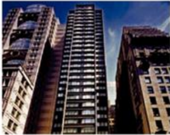
COURTYARD BY MARRIOTT MANHATTAN/FIFTH AVENUE, NEW YORK