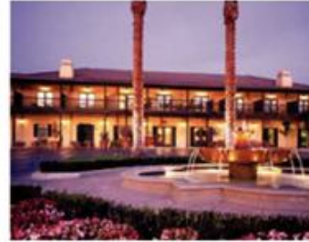
THE LODGE AT SONOMA, A RENAISSANCE RESORT AND SPA, CALIFORNIA