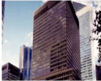
COURTYARD BY MARRIOTT MANHATTAN/MIDTOWN EAST, NEW YORK