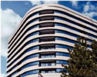
BETHESDA MARRIOTT SUITES, MARYLAND