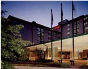
MARRIOTT ATLANTA ALPHARETTA, GEORGIA