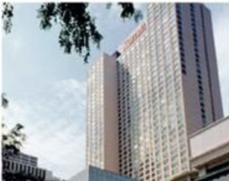
CHICAGO MARRIOTT DOWNTOWN MAGNIFICENT MILE, ILLINOIS