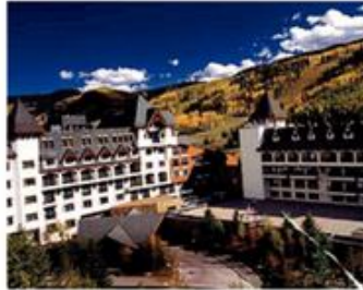
VAIL MARRIOTT MOUNTAIN RESORT & SPA, COLORADO