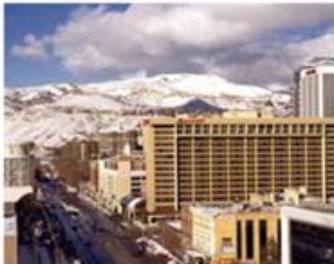
SALT LAKE CITY MARRIOTT DOWNTOWN, UTAH